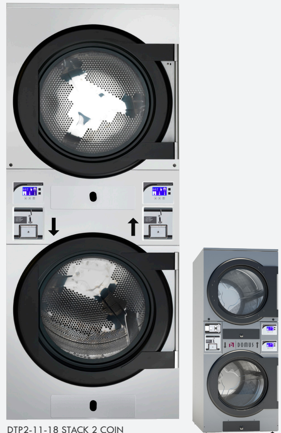
DTP2-11-18 STACK 2 COIN